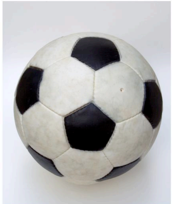
A una patada de la extinción (One kick from extinction) 27 x 19 x 27 cm Fiberglass, varnish