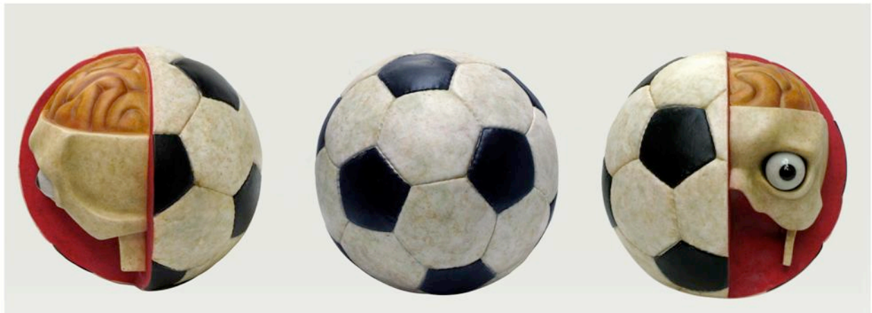
Hooligan's Anatomy 30 x 30 x 30 cm Resine, varnish