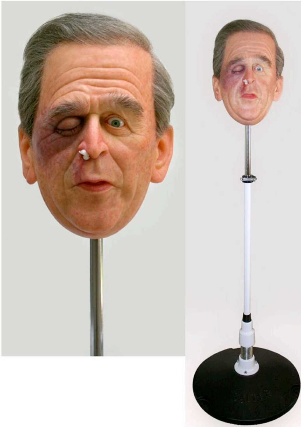
Punchin' Bush Variable high, 60 cm diameter Silicone, human hair, punch ball bar.