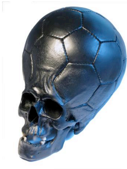
Deadball 27 x 19 x 27 cm Bronze